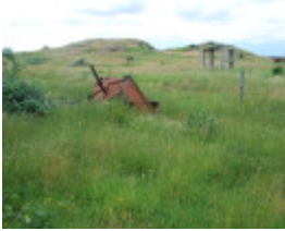
GELLIONDALE BRIQUETTE PLANT SOHE 2008