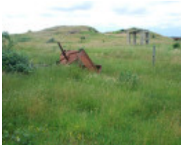
GELLIONDALE BRIQUETTE PLANT SOHE 2008