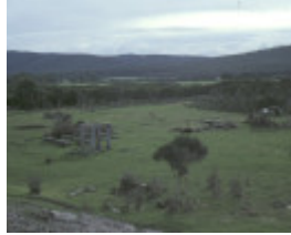
1 gelliondale briquette plant south gippsland hwy gelliondale site view jun1994