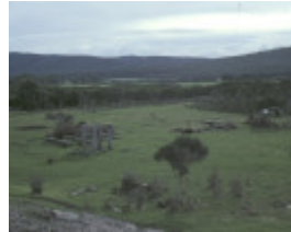
1 gelliondale briquette plant south gippsland hwy gelliondale site view jun1994