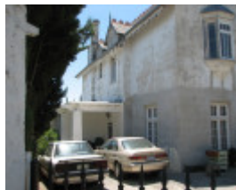
WHITBY HOUSE SOHE 2008