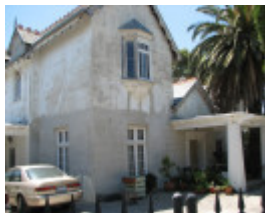
WHITBY HOUSE SOHE 2008