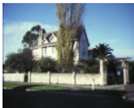
1 whitby house whitby street brunswick front view jul1979