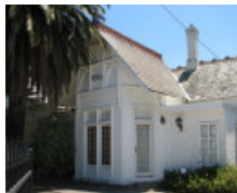
WHITBY HOUSE SOHE 2008