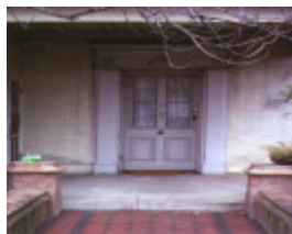
whitby house whitby street brunswick front entrance sep1979