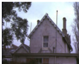
whitby house whitby street brunswick side view sep1979