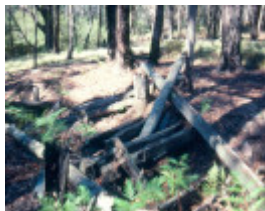
H02011 goodwood sawmill site