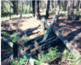
H02011 goodwood sawmill site