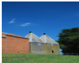
MOSSIFACE HOPKILNS SOHE 2008