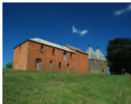
MOSSIFACE HOPKILNS SOHE 2008