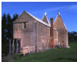
mossiface hopkilns bruthen wooden barn rear view may1983