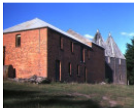
1 mossface hopkilns bruthen brick barn side view may1982