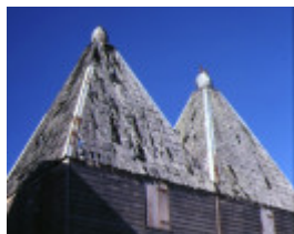
mossiface hopkilns bruthen pyramid roof may1982