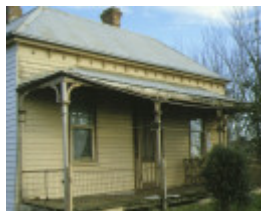
mossiface hopkilns bruthen cottage front view jul1980