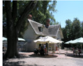
FORMER CURATOR'S COTTAGE SOHE 2008