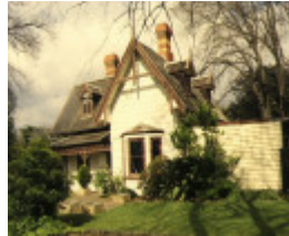
1 former curator's cottage queens park moonee ponds front view oct1994