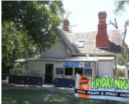
FORMER CURATOR'S COTTAGE SOHE 2008