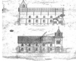
Welsley Sunday School - Ballarat Conservation Study, 1978