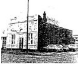
Manchester Unity Hall - film 6 / frame 14 - Ballarat Conservation Study, 1978