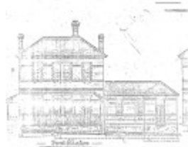
Ballarat Police Station02 - Ballarat Conservation Study, 1978