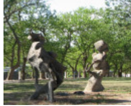
HEIDE 1 SOHE 2008