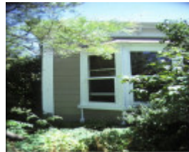
heidi 1 templestowe road bulleen bay window feb1988