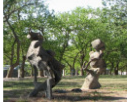
HEIDE 1 SOHE 2008