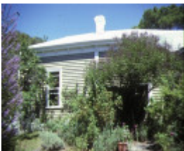
heidi 1 templestowe road bulleen rear view feb1988