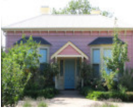
HEIDE 1 SOHE 2008