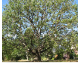
HEIDE 1 SOHE 2008