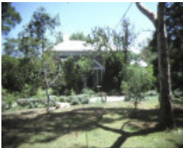
1 heidi 1 templestowe road bulleen front view feb1988