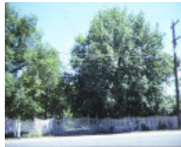
heidi 1 templestowe road bulleen front fence feb1988