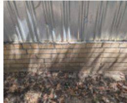
Damage to building