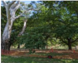
Damage to trees