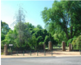
CASTLEMAINE BOTANICAL GARDENS SOHE 2008