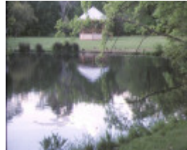
1 castlemaine botanical gardens lake & Pergola