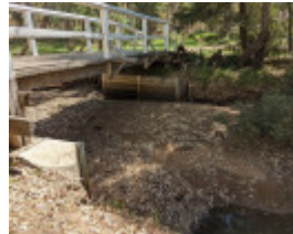
Build-up of material in waterway/under bridge