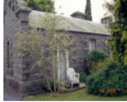
h00486 lauderdale prince street alfredton cottage she project 2003