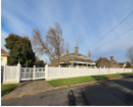
Lauderdale - July 2021