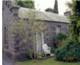
h00486 lauderdale prince street alfredton cottage she project 2003