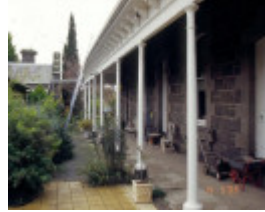
h00486 lauderdale prince street alfredton side view she project 2003