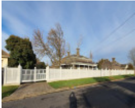
Lauderdale - July 2021