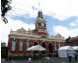
BUNINYONG TOWN HALL SOHE 2008