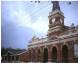
buninyong town hall street frontage dec1987