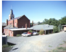
buninyong town hall rear view