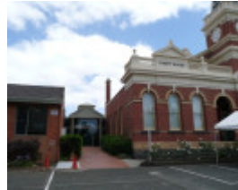
BUNINYONG TOWN HALL SOHE 2008