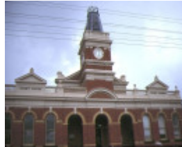
1 buninyong town hall front elevation dec1987