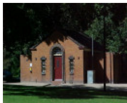
h01887 treasury gardens toilets mar 02 pm1