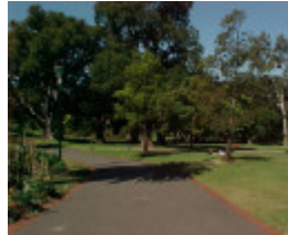
h01887 treasury gardens 1