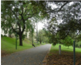
TREASURY GARDENS SOHE 2008