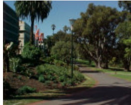
h01887 1 treasury gardens mar 02 pm1