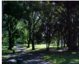
h01887 treasury gardens 4