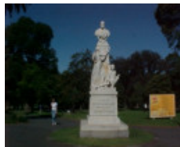
H01887 treasury gardens clarke mar 02 pm1