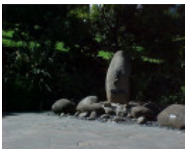
h01887 treasury gardens jfk mar 02 pm1