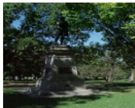
h01887 treasury gardens burns mar 02 pm1