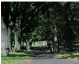
h01887 treasury gardens 6