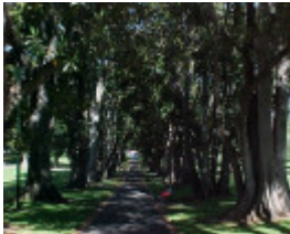
h01887 treasury gardens 2