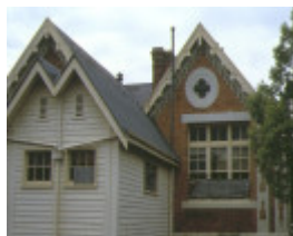
primary school number 461 burwood hyw burwood timber building feb1993