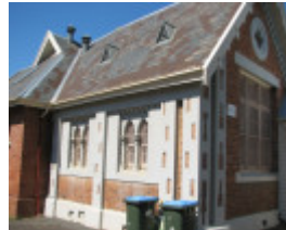
PRIMARY SCHOOL NO.461- FORMER BURWOOD SCHOOL SOHE 2008