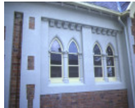
primary school number 461 burwood hwy burwood detail of windows