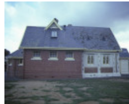
primary school number 461 burwood hwy burwood rear view sep1984