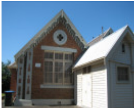
PRIMARY SCHOOL NO.461- FORMER BURWOOD SCHOOL SOHE 2008