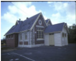
1 primary school number 461 burwood hwy burwood side view sep1984