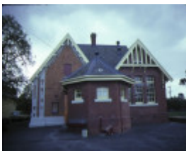
primary school number 461 burwood hwy burwood rounded wing sep1984