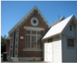
PRIMARY SCHOOL NO.461- FORMER BURWOOD SCHOOL SOHE 2008