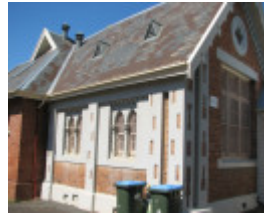
PRIMARY SCHOOL NO.461- FORMER BURWOOD SCHOOL SOHE 2008