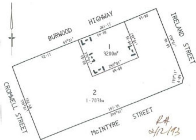
H0975 plan 602601 B