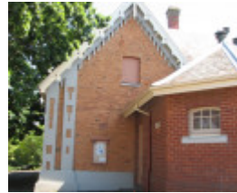
PRIMARY SCHOOL NO.461- FORMER BURWOOD SCHOOL SOHE 2008