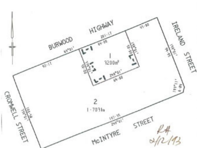
H0975 plan 602601 B