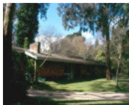
h02053 h2053 bv 15 pine road oct 2003