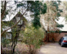
h02053 h2053 bv wimborne june 2003