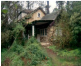
h02053 h2053 bv the cabin june 2003