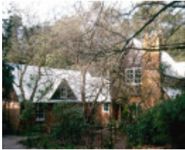
h02053 h2053 bv house in bv road sept 2003