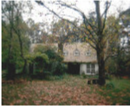
h02053 h2053 bv lynton lee june 2003