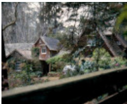
h02053 h2053 bv sonning june 2003