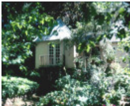
Downderry November 2002