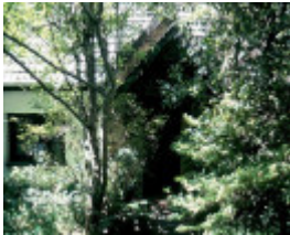
h02053 h2053 bv sheilan nov 2002