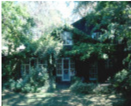
h02053 h2053 bv the barn nov 2002