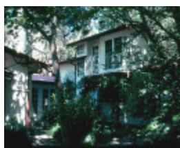
h02053 h2053 bv devon cottage nov 2002