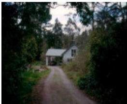
h02053 h2053 bv spinney 15 bv road june 2003