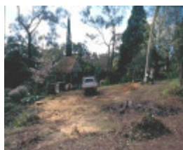
h02053 h2053 bv 146 cardigan road june 2003