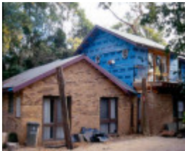
Bickleigh Vale Bickleigh Vale Rd June 2003