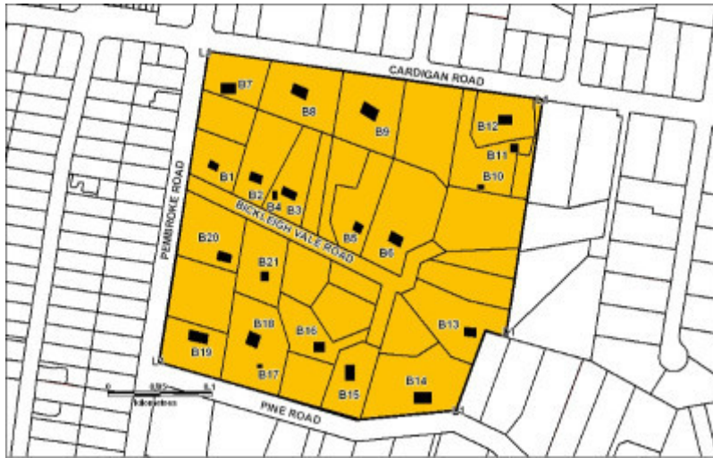
h02053 bickleigh vale extent draft nov 2003