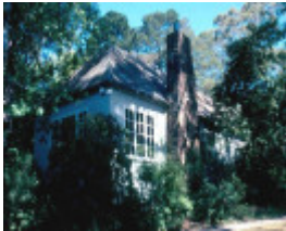
h02053 h2053 bv mistover nov 2002