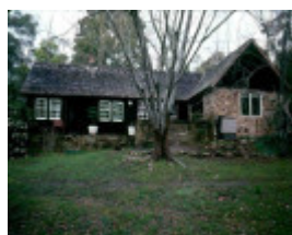
h02053 h2053 bv glencairn in winter