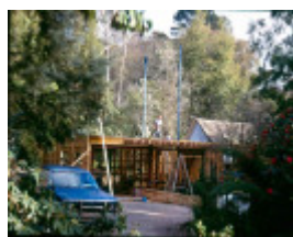
h02053 h2053 bv 112 cardigan road sept 2003