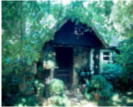
h02053 h2053 bv hurst nov 2002