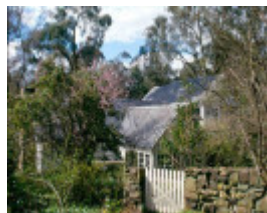
h02053 h2053 bv badgers wood entrance june 2003