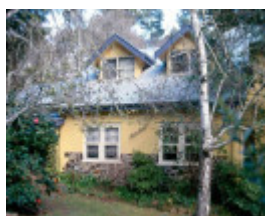
h02053 h2053 bv bena lodge june 2003