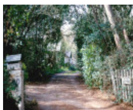
h02053 h2053 bv cornerways sept 2003