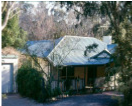
h02053 h2053 bv 136 cardigan road june 2003