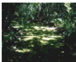
h02053 h2053 bv glencairn moss lawn nov 2002