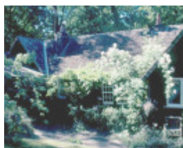
h02053 h2053 bv glencairn in spring