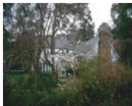
h02053 h2053 bv badgers wood june 2003