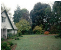
Bickleigh Vale Lynton Lee Garden June 2003