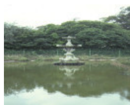
wattle park riversdale road surrey hills fountain