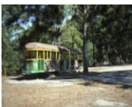
wattle park riversdale road surrey hills w2 class tram picnic shelter