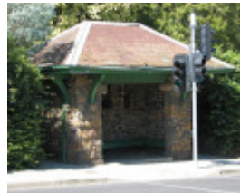
WATTLE PARK SOHE 2008