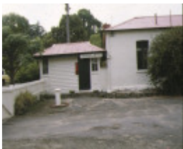
wattle park riversdale road surrey hills former stables and curator's office shelter