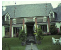
1 wattle park riversdale road surrey hills chalet