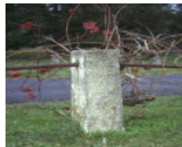
wattle park riversdale road surrey hills fence made from disused cable tram