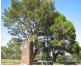
WATTLE PARK SOHE 2008