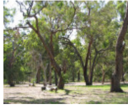
WATTLE PARK SOHE 2008