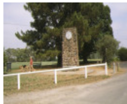
wattle park riversdale road surrey hills memorial clock and tree from lone pine