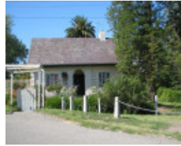
WATTLE PARK SOHE 2008