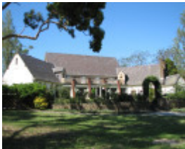
WATTLE PARK SOHE 2008