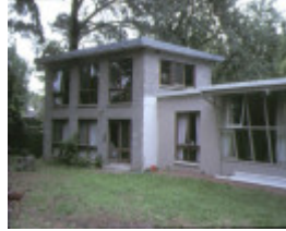
former robin boyd house camberwell double storey section of the house dec1990