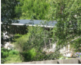
FORMER ROBIN BOYD HOUSE SOHE 2008