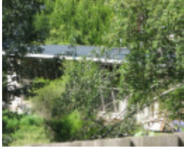
FORMER ROBIN BOYD HOUSE SOHE 2008