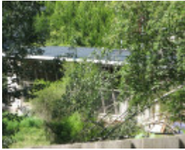
FORMER ROBIN BOYD HOUSE SOHE 2008