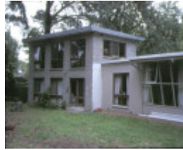
former robin boyd house camberwell double storey section of the house dec1990