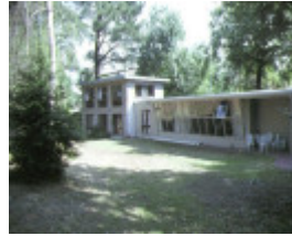
1 former robin boyd house camberwell side view dec1990