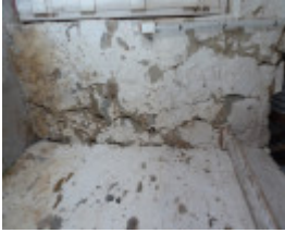
H1222 CAPE OTWAY LIGHTSTATION LHA 2015 5.JPG