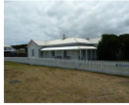
H1222 CAPE OTWAY LIGHTSTATION LHA 2015 3.JPG