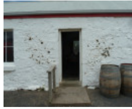
H1222 CAPE OTWAY LIGHTSTATION LHA 2015 4.JPG