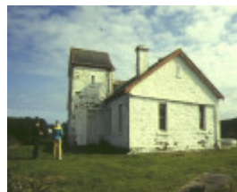
cape otway lightstation signal station rear view aug1996