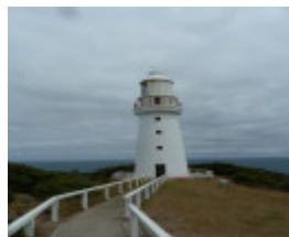
H1222 CAPE OTWAY LIGHTSTATION LHA 2015 1.JPG