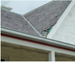
H1222 CAPE OTWAY LIGHTSTATION LHA 2015 8.JPG