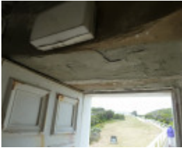
H1222 CAPE OTWAY LIGHTSTATION LHA 2015 2.JPG