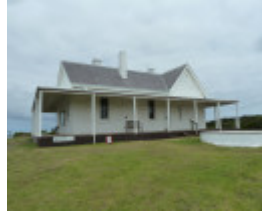
H1222 CAPE OTWAY LIGHTSTATION LHA 2015 7.JPG