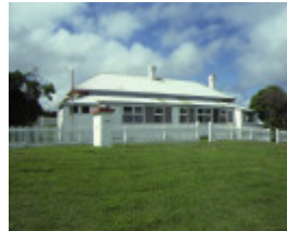
cape otway lightstation front view nov1997