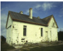
cape otway lightstation signal station front view aug1996