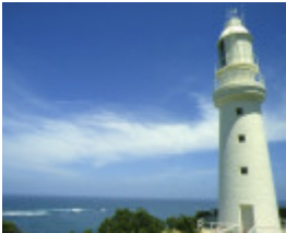
1 cape otway lightstation light house