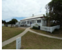
H1222 CAPE OTWAY LIGHTSTATION LHA 2015 6.JPG