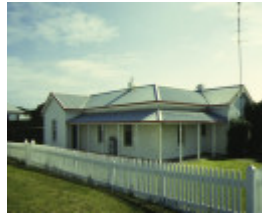
cape otway lightstation residence aug1996