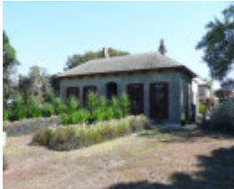
MELALEUKA SOHE 2008