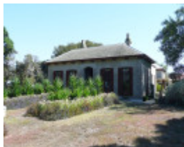
MELALEUKA SOHE 2008