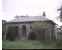
1 melaleuka leopold front elevation may1995