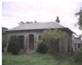
1 melaleuka leopold front elevation may1995