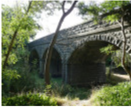
BRIDGE SOHE 2008