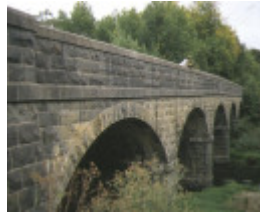
1 bridge over moorabool river batesford side view apr1997