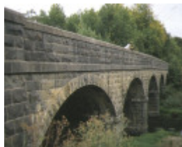
1 bridge over moorabool river batesford side view apr1997