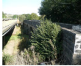
BRIDGE SOHE 2008