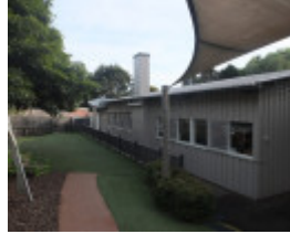
RCK rear elevation.jpg