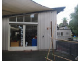
RCK rear playroom doors to playground.jpg