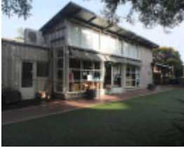
RCK north east facade.jpg