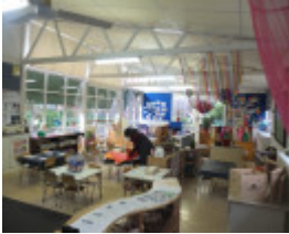
RCK rear playroom interior view.jpg