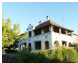
ASHBY PRESBYTERY OF ST PETER AND ST PAUL SOHE 2008