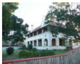
ASHBY PRESBYTERY OF ST PETER AND ST PAUL SOHE 2008