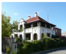
ASHBY PRESBYTERY OF ST PETER AND ST PAUL SOHE 2008