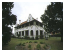
1 ashby presbytery of st peter & st paul geelong side view apr1997