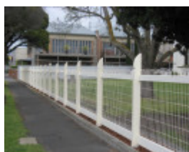
Miscellaneous photos Oct 2010 034.jpg