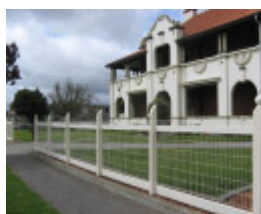
Miscellaneous photos Oct 2010 037.jpg