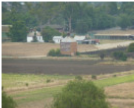
Chicory kiln Maddingley