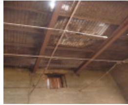
Chicory kiln Maddingley