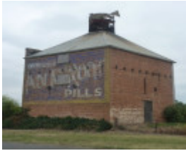
Chicory kiln Maddingley