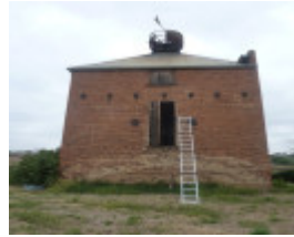
Chicory kiln Maddingley