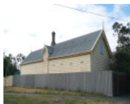
BELLEVILLE SOHE 2008