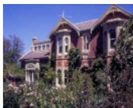
h01188 1 belleville ryrie street geelong front view she project 2004