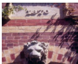
belleville ryrie street geelong carving front door she project 2004