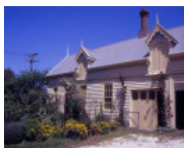
belleville ryrie street geelong stables she project 2004