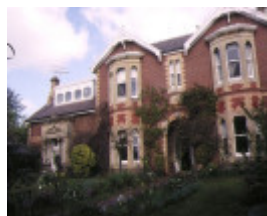
h01188 bellville ryrie street geelong front view aug1995