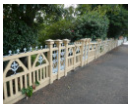
BELLEVILLE SOHE 2008