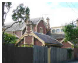
BELLEVILLE SOHE 2008