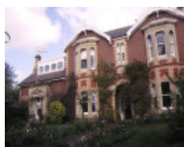
h01188 bellville ryrie street geelong front view aug1995