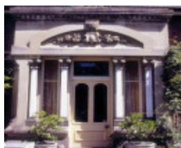
belleville ryrie street geelong front door billiard room she project 2004