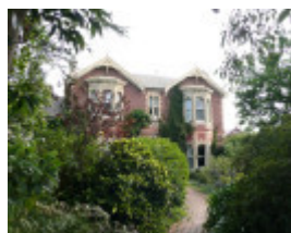
BELLEVILLE SOHE 2008