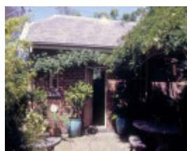
belleville ryrie street geelong fbback stables she project 2004