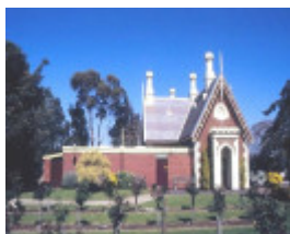
eastern cemetery gatehouse ormond road geelong garden she project 2003