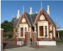
EASTERN CEMETERY GATEHOUSE SOHE 2008