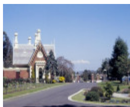
eastern cemetery gatehouse ormond road geelong driveway she project 2003