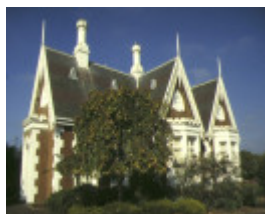
h01170 eastern cemetery gatehouse ormond road geelong front view