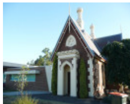
EASTERN CEMETERY GATEHOUSE SOHE 2008