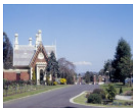
eastern cemetery gatehouse ormond road geelong driveway she project 2003