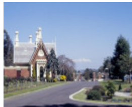
eastern cemetery gatehouse ormond road geelong driveway she project 2003