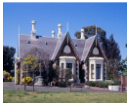
h01170 1 eastern cemetery gatehouse ormond road geelong gatehouse she project 2003