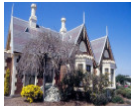
eastern cemetery gatehouse ormond road geelong close up she project 2003