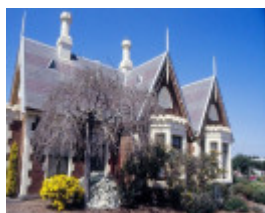
eastern cemetery gatehouse ormond road geelong close up she project 2003