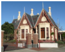
EASTERN CEMETERY GATEHOUSE SOHE 2008