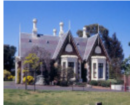
h01170 1 eastern cemetery gatehouse ormond road geelong gatehouse she project 2003