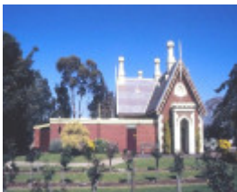
eastern cemetery gatehouse ormond road geelong garden she project 2003