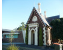
EASTERN CEMETERY GATEHOUSE SOHE 2008