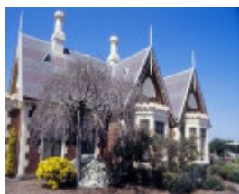
eastern cemetery gatehouse ormond road geelong close up she project 2003