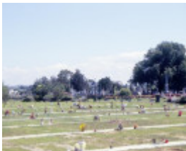
eastern cemetery gatehouse ormond road geelong cemetery she project 2003