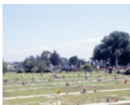
eastern cemetery gatehouse ormond road geelong cemetery she project 2003