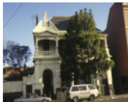
1 the geelong club geelong front view aug1995