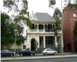
THE GEELONG CLUB SOHE 2008