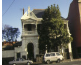
1 the geelong club geelong front view aug1995