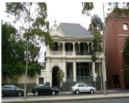
THE GEELONG CLUB SOHE 2008