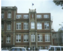
Gordon Technical College Geelong Front Elevation August 1995