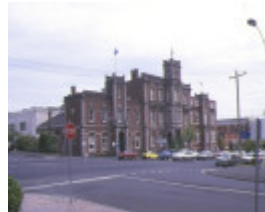
1 gordon technical college geelong front view dec1993