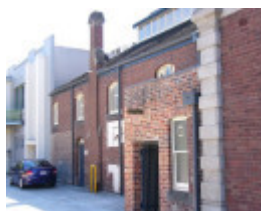
h01019 gordon technical college fenwick street geelong bldgd1 davidson hall she project 2004