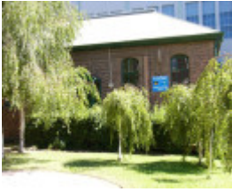
h01019 gordon technical college fenwick street geelong bldgf1 chemical laboratory she project 2004