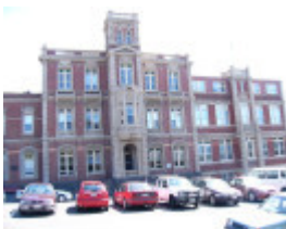
h01019 gordon technical college fenwick street geelong bldga administration bldg she project 2004