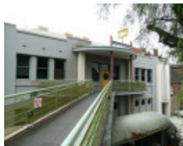
GORDON TECHNICAL COLLEGE SOHE 2008