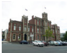
GORDON TECHNICAL COLLEGE SOHE 2008