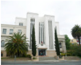
GORDON TECHNICAL COLLEGE SOHE 2008