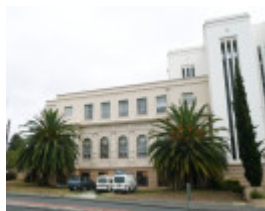
GORDON TECHNICAL COLLEGE SOHE 2008