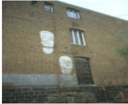
Gordon Technical College Geelong Bluestone Base August 1995