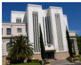
h01019 gordon technical college fenwick street geelong bldg t1 textile college she project 2004