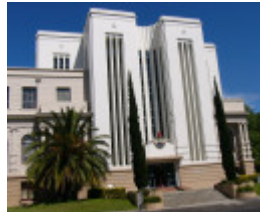
h01019 gordon technical college fenwick street geelong bldg t1 textile college she project 2004