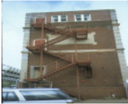
Gordon Technical College Geelong Exterior Staircase August 1995