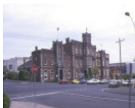
1 gordon technical college geelong front view dec1993