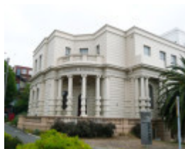
GORDON TECHNICAL COLLEGE SOHE 2008