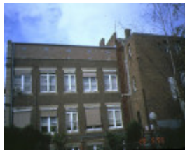
Gordon Technical College Geelong Side Windows November 1995