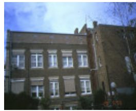
Gordon Technical College Geelong Side Windows November 1995