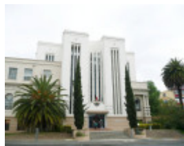
GORDON TECHNICAL COLLEGE SOHE 2008