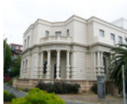
GORDON TECHNICAL COLLEGE SOHE 2008