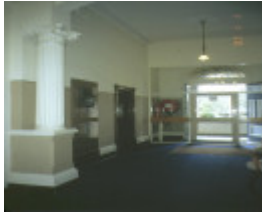
Gordon Technical College Geelong Interior Entrance August 1995