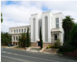
GORDON TECHNICAL COLLEGE SOHE 2008