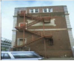
Gordon Technical College Geelong Exterior Staircase August 1995