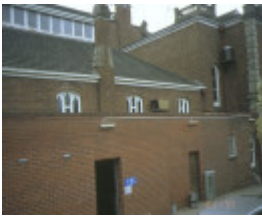
Gordon Technical College Geelong Rear View August 1995