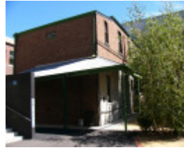
h01019 gordon technical college fenwick street geelong bldgf2 plumbing carpentry art modelling she project 2004