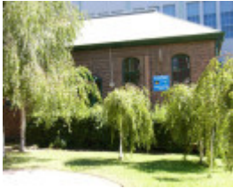
h01019 gordon technical college fenwick street geelong bldgf1 chemical laboratory she project 2004