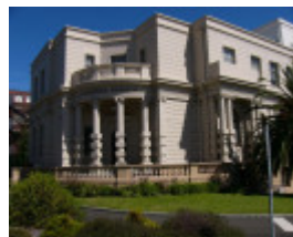
h01019 gordon technical college fenwick street geelong bldgc and bostock memorial she project 2004