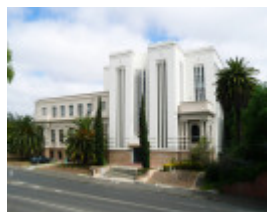
GORDON TECHNICAL COLLEGE SOHE 2008