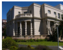
h01019 gordon technical college fenwick street geelong bldgc and bostock memorial she project 2004