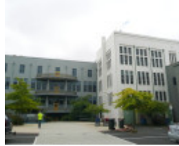
GORDON TECHNICAL COLLEGE SOHE 2008