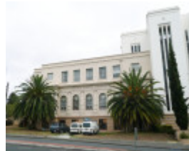
GORDON TECHNICAL COLLEGE SOHE 2008