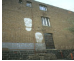
Gordon Technical College Geelong Bluestone Base August 1995