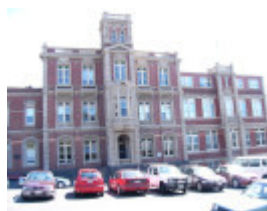
h01019 gordon technical college fenwick street geelong bldga administration bldg she project 2004