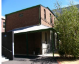
h01019 gordon technical college fenwick street geelong bldgf2 plumbing carpentry art modelling she project 2004