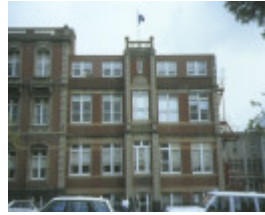
Gordon Technical College Geelong Front Elevation August 1995