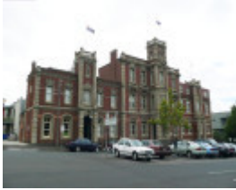
GORDON TECHNICAL COLLEGE SOHE 2008