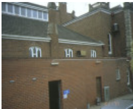
Gordon Technical College Geelong Rear View August 1995