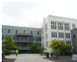
GORDON TECHNICAL COLLEGE SOHE 2008