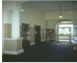
Gordon Technical College Geelong Interior Entrance August 1995