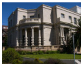
h01019 gordon technical college fenwick street geelong bldgc and bostock memorial she project 2004