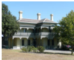
ST MARY OF THE ANGELS CATHOLIC CHURCH SOHE 2008