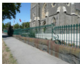
ST MARY OF THE ANGELS CATHOLIC CHURCH SOHE 2008