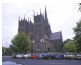
1 st mary of the angles catholic church yarra street geelong front elevation dec1993