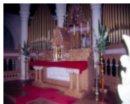
h01026 st mary of the angels catholic church yarra street geelong high altar she project 2003