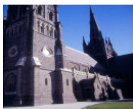
h01026 st mary of the angels catholic church yarra street geelong church exterioro she project 2003