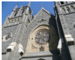
ST MARY OF THE ANGELS CATHOLIC CHURCH SOHE 2008