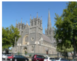
ST MARY OF THE ANGELS CATHOLIC CHURCH SOHE 2008