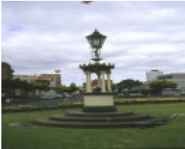
1 belcher drinking fountain geelong front view