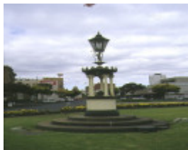
1 belcher drinking fountain geelong front view