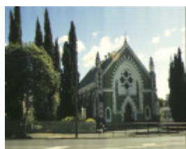
1 former newtown methodist church pakington street geelong front view aug1995