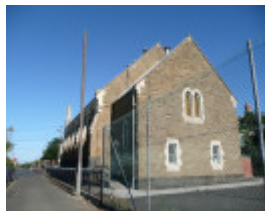
FORMER NEWTOWN METHODIST CHURCH SOHE 2008