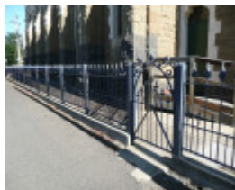
FORMER NEWTOWN METHODIST CHURCH SOHE 2008