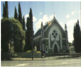
1 former newtown methodist church pakington street geelong front view aug1995