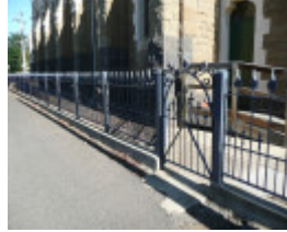
FORMER NEWTOWN METHODIST CHURCH SOHE 2008