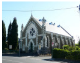
FORMER NEWTOWN METHODIST CHURCH SOHE 2008