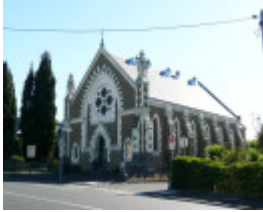
FORMER NEWTOWN METHODIST CHURCH SOHE 2008