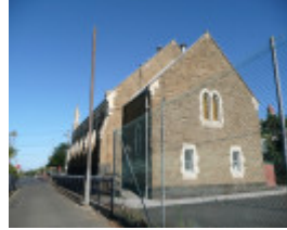
FORMER NEWTOWN METHODIST CHURCH SOHE 2008