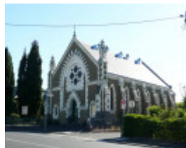
FORMER NEWTOWN METHODIST CHURCH SOHE 2008