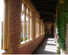
GEELONG COLLEGE SOHE 2008