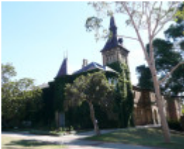
GEELONG COLLEGE SOHE 2008