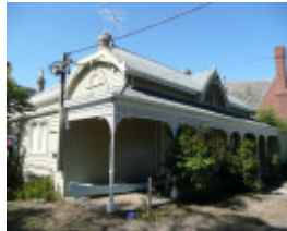
GEELONG COLLEGE SOHE 2008