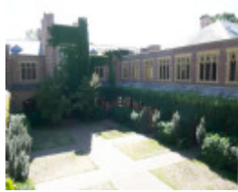
GEELONG COLLEGE SOHE 2008