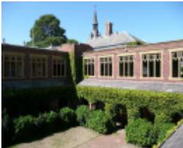
GEELONG COLLEGE SOHE 2008