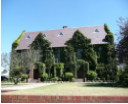
GEELONG COLLEGE SOHE 2008