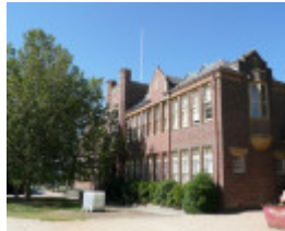
GEELONG COLLEGE SOHE 2008