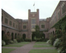
1 geelong college talbot street newtown cloisters nov1990