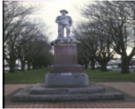
finlay ave of elms precinct camperdown empire war memorial