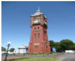
FINLAY AVENUE OF ELMS, MANIFOLD CLOCK TOWER AND PUBLIC MONUMENT PRECINCT SOHE 2008