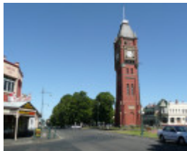
FINLAY AVENUE OF ELMS, MANIFOLD CLOCK TOWER AND PUBLIC MONUMENT PRECINCT SOHE 2008