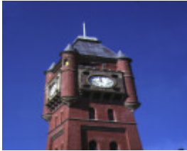
finlay ave of elms precinct camperdown detail of clock tower