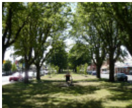
FINLAY AVENUE OF ELMS, MANIFOLD CLOCK TOWER AND PUBLIC MONUMENT PRECINCT SOHE 2008