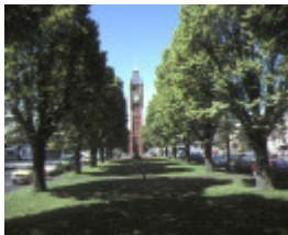
finlay ave of elms precinct camperdown avenue view