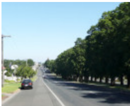
FINLAY AVENUE OF ELMS, MANIFOLD CLOCK TOWER AND PUBLIC MONUMENT PRECINCT SOHE 2008