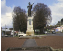
finlay ave of elms precinct camperdown soldier's memorial