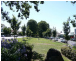
FINLAY AVENUE OF ELMS, MANIFOLD CLOCK TOWER AND PUBLIC MONUMENT PRECINCT SOHE 2008