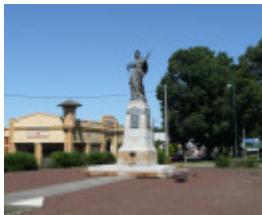
FINLAY AVENUE OF ELMS, MANIFOLD CLOCK TOWER AND PUBLIC MONUMENT PRECINCT SOHE 2008