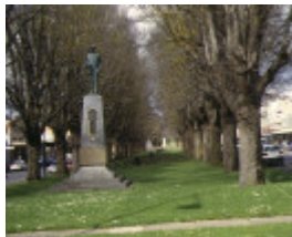
1 finlay ave of elms precinct camperdown j c manifold monument & ave of elms