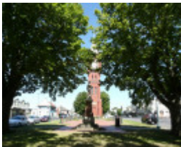
FINLAY AVENUE OF ELMS, MANIFOLD CLOCK TOWER AND PUBLIC MONUMENT PRECINCT SOHE 2008