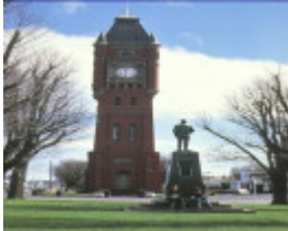
finlay ave of elms precinct camperdown view of clock tower