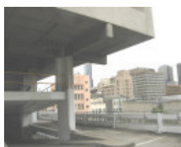
Total House office supports