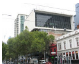
Total House view from south