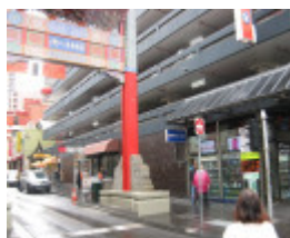
Total House Little Bourke St shops