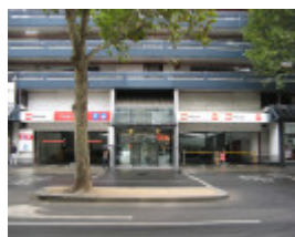
Total House Russell St entrance