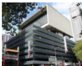
Total House Russell St view