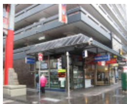
Total House corner shops