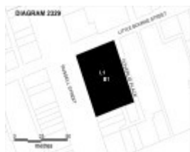
total car park plan.jpg