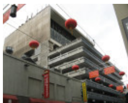
Total House view from Little Bourke