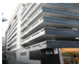
Total House laneway side