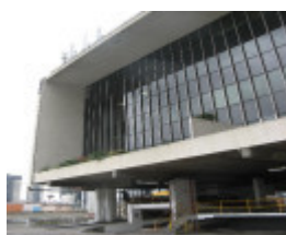
Total House office structure