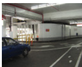
Total House ground level interior