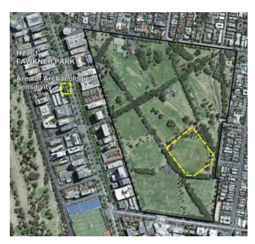
Diagram of Archaeological Sensitivity