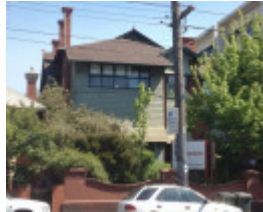
274 High Street, Windsor