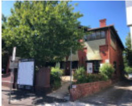
274 High Street, Windsor (2).jpeg