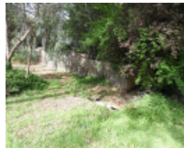
Brisbane St drain d