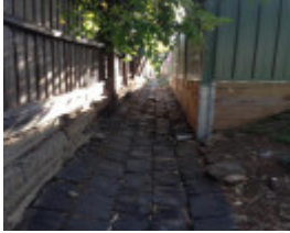
Bluestone drain Brisbane St and Ormond Rd