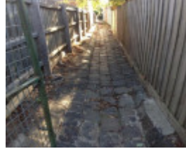
Bluestone drain Brisbane St and Ormond Rd