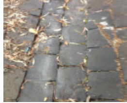
Bluestone drain Brisbane St and Ormond Rd