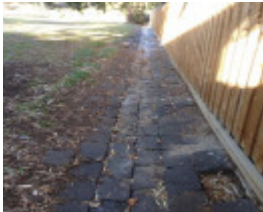
Bluestone drain Brisbane St and Ormond Rd