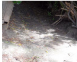
Brisbane St drain b