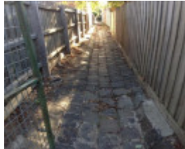
Bluestone drain Brisbane St and Ormond Rd