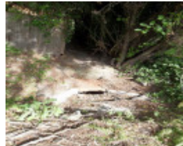
Brisbane St drain a