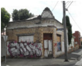
116 The Parade