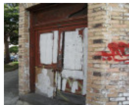
116 The Parade