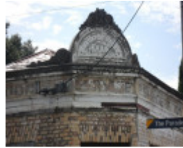
116 The Parade