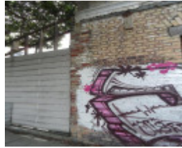
116 The Parade