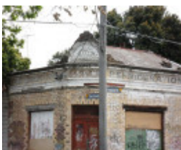
The Parade 116 b