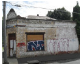
116 The Parade