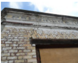
116 The Parade