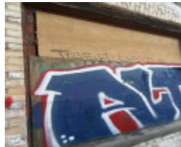
116 The Parade