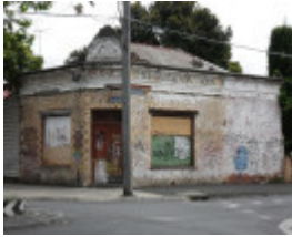
The Parade 116 a