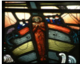
Shelford Biddlecombe 1931