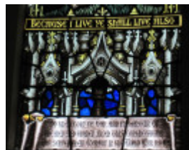
Hawthorn West Presbyterian [now Uniting] Church Second World War memorial inscription, Brooks Robinson & Co. 1947