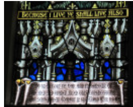
Hawthorn West Presbyterian [now Uniting] Church Second World War memorial inscription, Brooks Robinson & Co. 1947