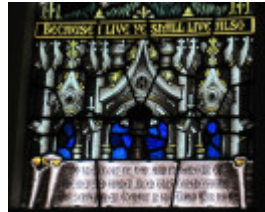
Hawthorn West Presbyterian [now Uniting] Church Second World War memorial inscription, Brooks Robinson & Co. 1947