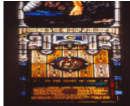
Armadale Presbyterian [now Uniting] Church, Good Samaritan, Derek Pearse inscription c1960