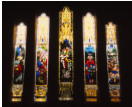
Armadale Presbyterian [now Uniting] Church, Good Samaritan, Derek Pearse inscription c1960