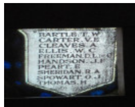
Castlemaine Uniting Church