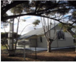
Yanac Uniting Church