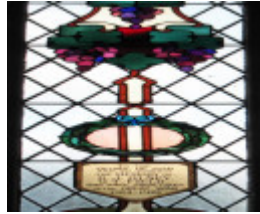
Yanac Uniting Church War memorial detail