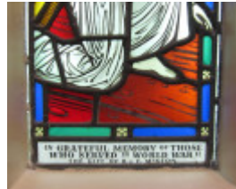
Sandringham All Souls Anglican Ferguson&Papas inscription