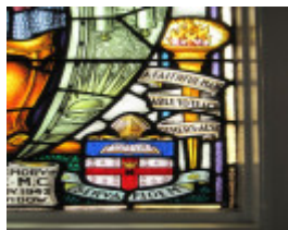
Ballarat Grammar School Chapel