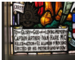
Ballarat Grammar School Chapel, Faithful Knight, inscription and AIF Badge, Mathieson & Gibson 1951