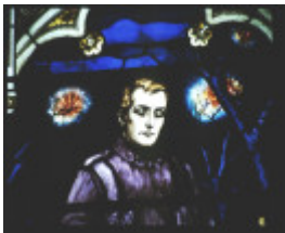
Ballarat Barkly St Uniting Church, detail of soldier, Fisher & Co. 1920