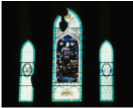
Ballarat Barkly St Uniting Church, First World War memorial, Fisher & Co. 1920