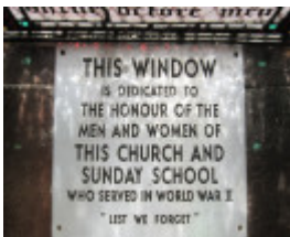
Burwood Uniting Church [formerly Methodist], plaque n.d.