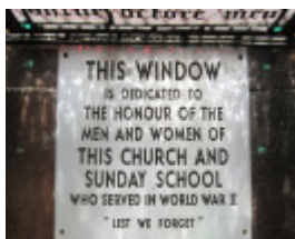
Burwood Uniting Church [formerly Methodist], plaque n.d.