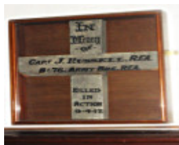
Snake Valley Carngham Uniting Church Russell cross