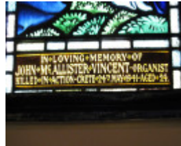
Brunswick Christ Church Anglican Jesu Joy inscription, Mathieson & Gibson cartoon, made by Brooks, Robinson & Co. 1952