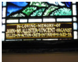
Brunswick Christ Church Anglican Jesu Joy inscription, Mathieson & Gibson cartoon, made by Brooks, Robinson & Co. 1952