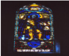
Beechworth Christchurch Anglican, St Michael, Mathieson & Gibson n.d.