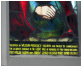
North Essendon Christ Church Anglican Ascension