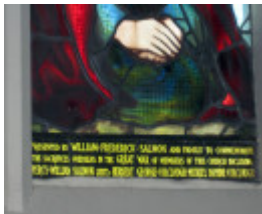
North Essendon Christ Church Anglican Ascension